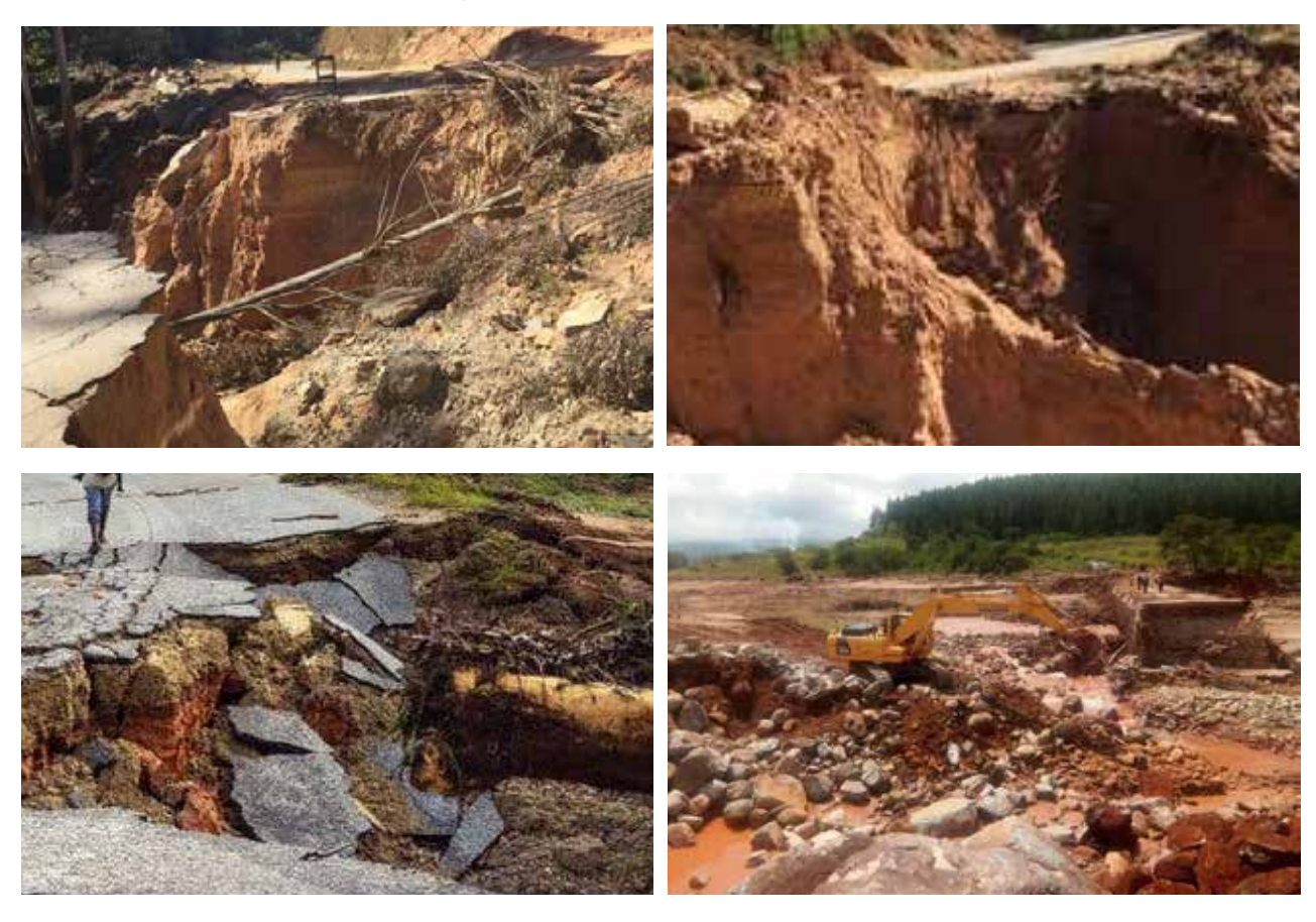
Chimanimani - after relief work